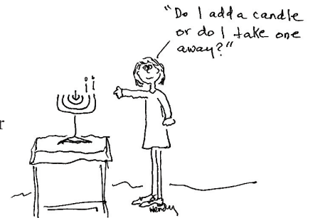
The Chanukah Dilemma