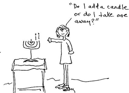
The Chanukah Dilemma